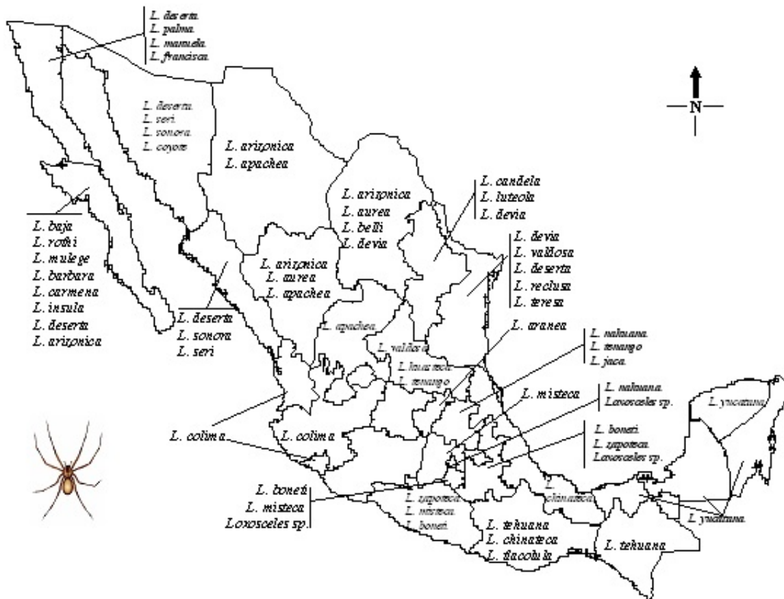
Map. 1: Loxosceles species in Mexico (Hoffmann, 1976 and Gertsch, 1983)

between species[29]. The lethal dose (LD 50 ) of L. intermedia is 0.48 mg/kg that of L. gaucho 0.74 mg/kg, while for L. laeta is 1.45 mg/kg. The dermonecrotic and lethal activities are detected in the A fraction of the three species, whose largest protein is 35 KDa in L. gaucho and L. intermedia , but 32 KDa (reported as sphingomyelinase) in L. laeta responsible for necrotic damage. All contain common residues in their N-terminal sequences. The identity is 50% between L. gaucho and L. reclusa and 61.1% between L. intermedia and L. reclusa [10,104]. Ontogenic differences are seen in the venom action in L. intermedia , being more lethal and dermonecrotic that of adult spiders than those from newborn, and of greater potency in females[13]. The volume that they inject when biting is in direct relation to the time that has passed since they last ate, with greater availability of venom if submitted to prolonged fasting[121].