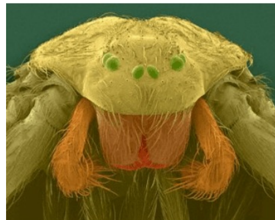
Fig. 2: Left: Electron Microscopy Microphotograph, frontal view of the cephalothorax showing the ocular formula (2, 2, 2) and the stridulatory apparatus[73,74].

capable of producing intense pain. Spermine may represent the final toxic product of the specialization that has occurred in certain lines of spiders during their evolution[105]. In fact, the polyaminamides, polar compounds of low molecular weight, act at the membrane stabilization level, blocking Ca 2+ and Mg 2+ channels, chelation of metallic ions and presynaptic and postsynaptic transmitters[107]. The acylpolyamines of low molecular weight are paralyzing and are composed of an aromatic portion containing amino acids and polyamines. These substances are main components of many poisonous spiders and are named “glutamate receptor antagonists”[10], rich in proteins with N-mannase residues (Loxolisine B) that provide the gelatinolytic activity, identified as two zymogens (serine-protease) of 85 and 95 KDa with no laminolytic activity[99,108]. The glycosilation of certain loxolisine B residues, a glycoprotein of 32-35 KDa, with metalloproteinase activity (endopeptidase containing an atom of zinc and secreted by connective tissue cells, phagocytes and a number of transformed cells) is important for the dermonecrotic activity. The substrates are collagen, fibronectin, elastin and alpha-1-antitripsin, among