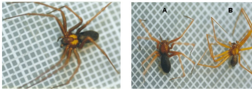
Fig. 1: Left: Female Loxosceles sp located in the state of Jalisco. Right: A) Female and B) Male of Loxosceles sp, from the state of Quintana Roo (Property of the National Collection of Acarus of the UNAM Institute of Biology, México).

capable of producing intense pain. Spermine may represent the final toxic product of the specialization that has occurred in certain lines of spiders during their evolution[105]. In fact, the polyaminamides, polar compounds of low molecular weight, act at the membrane stabilization level, blocking Ca 2+ and Mg 2+ channels, chelation of metallic ions and presynaptic and postsynaptic transmitters[107]. The acylpolyamines of low molecular weight are paralyzing and are composed of an aromatic portion containing amino acids and polyamines. These substances are main components of many poisonous spiders and are named “glutamate receptor antagonists”[10], rich in proteins with N-mannase residues (Loxolisine B) that provide the gelatinolytic activity, identified as two zymogens (serine-protease) of 85 and 95 KDa with no laminolytic activity[99,108]. The glycosilation of certain loxolisine B residues, a glycoprotein of 32-35 KDa, with metalloproteinase activity (endopeptidase containing an atom of zinc and secreted by connective tissue cells, phagocytes and a number of transformed cells) is important for the dermonecrotic activity. The substrates are collagen, fibronectin, elastin and alpha-1-antitripsin, among